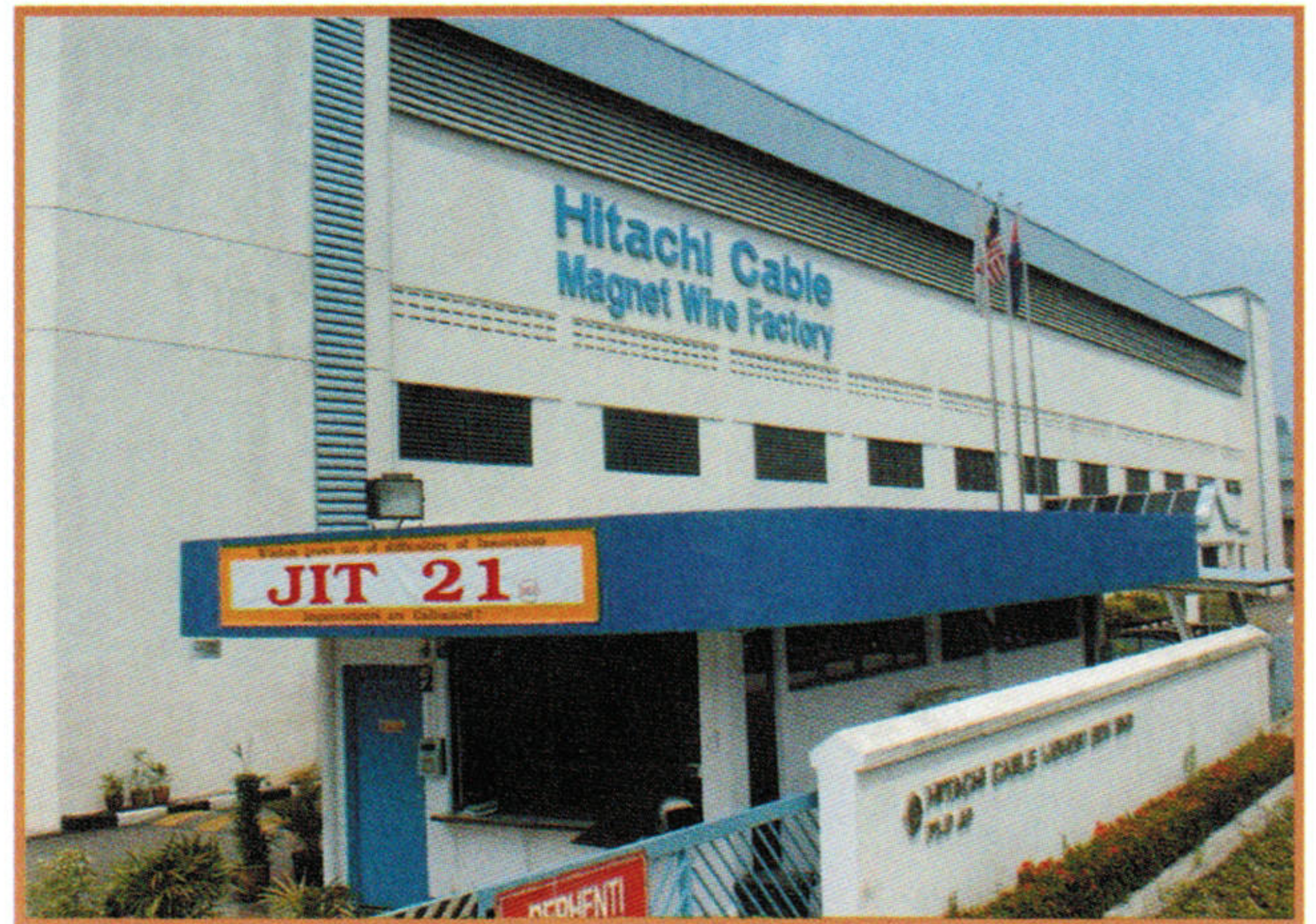
HITACHI CABLE (J) SDN. BHD.