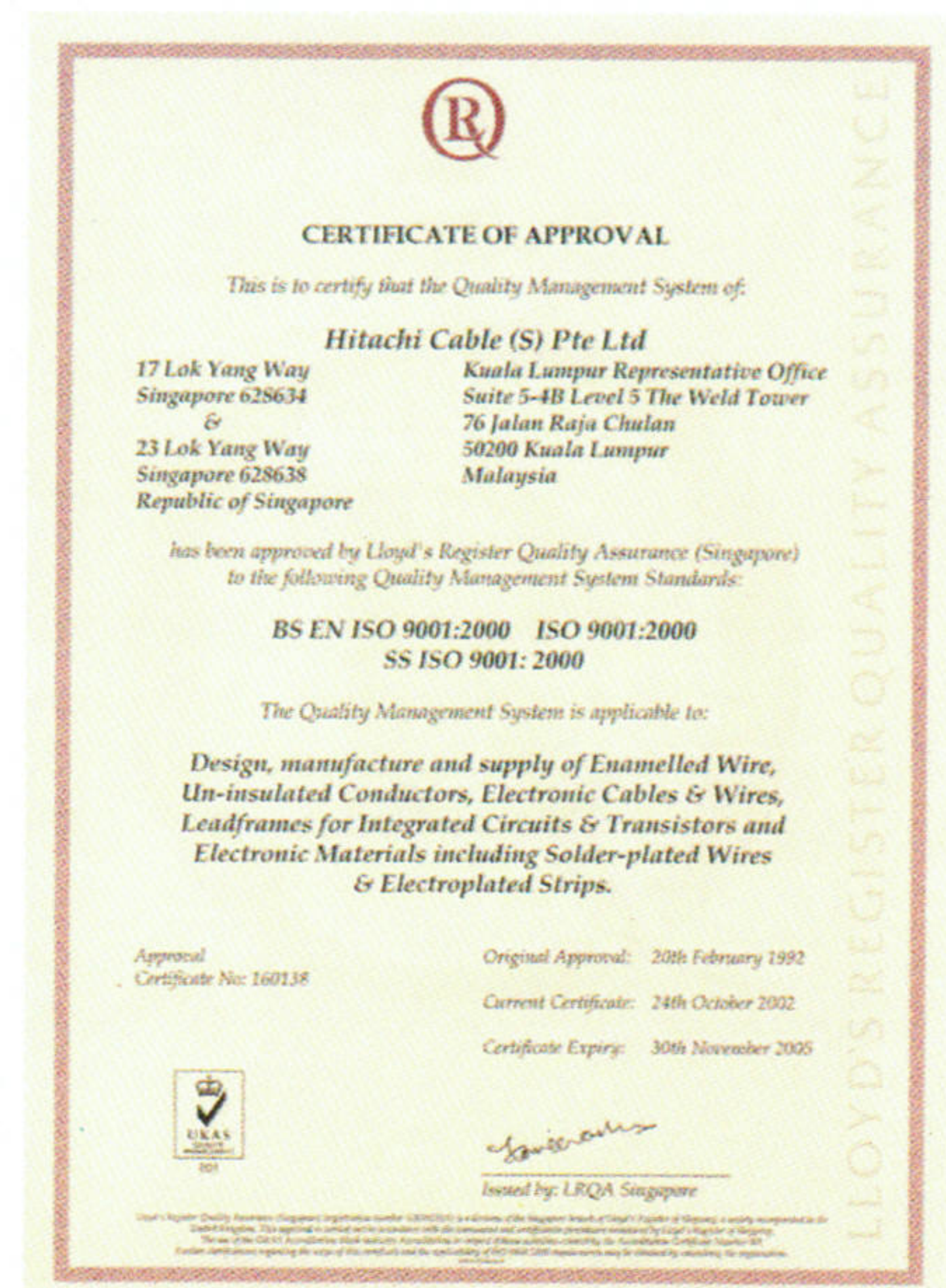
ISO 9001 (SINGAPORE) Certificate No: 160138