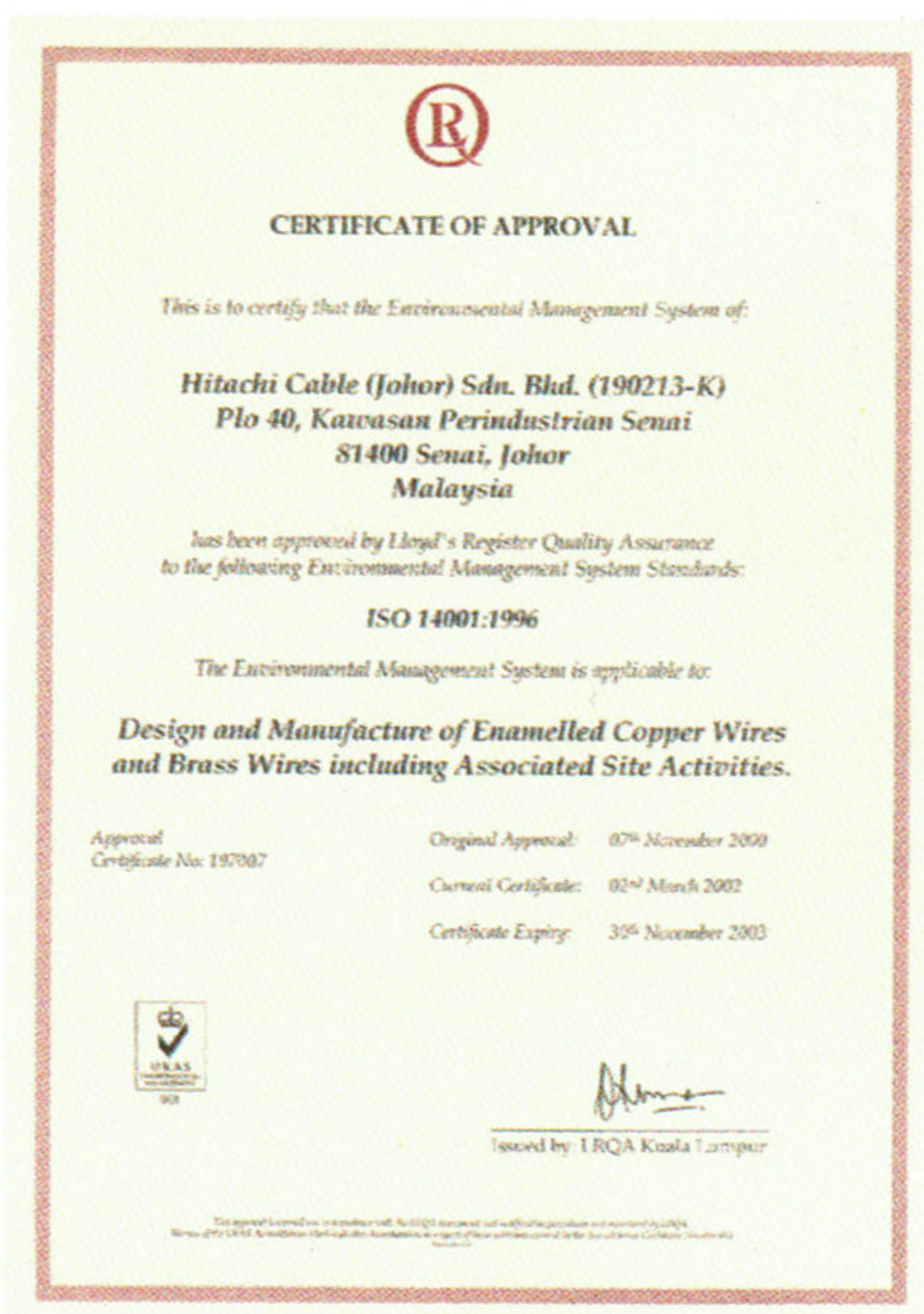
ISO 14001 (JOHOR) Certificate No: 197007

The attainment of the internationally recognized and prestigious ISO 9001 and ISO 14001 certifications are new laurels, marking our relentless drive towards total business excellence.