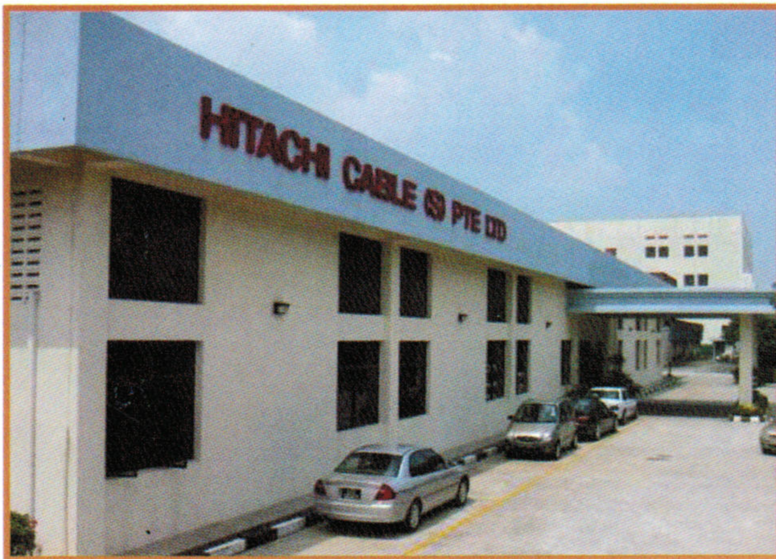
HITACHI CABLE (S) PTE. LTD